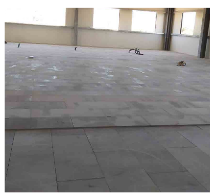
PRODUCTS USED IN THIS SYSTEM